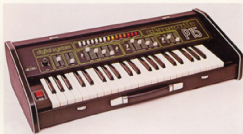
EKOSYNTH P.15 (N. 3224)

SYNTHESIZER monofonico con tastiera a 44 tasti (FA-DO). Interruttore On/Off - Volume Generale - PITCH (controllo di intonazione) - GLIDE (Velocità di escursione tra due frequenze) - Forma d'onda L.F.O. - L.F.O.: Velocità, Wah-Wah, Tremolo, Vibrato - Vibrato-Delay - V.C.F.: Presets - Controllo normale - V.C.F.: Cut-off frequency, Resonance, Attack, Sustain - VCA: Presets (controllo manuale). Attack, Sustain.