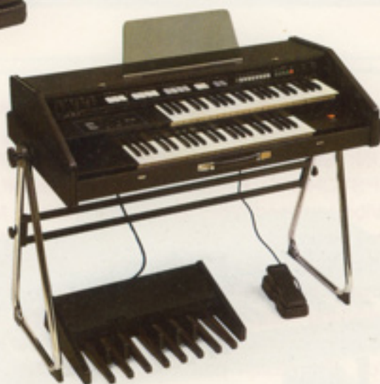
Versione con pedaliera dei Bassi (opzionale) Version with Bass Pedal Board (optional) Version avec Pedalier (optionnel)

Deux claviers de 44 touches (de FA à DO). Rotary Sound (Leslie électroniques): On/Off - Chorus/Tremolo. Volume des basses du pédalier. Sustain des basses du pédalier. Sustain des registres-voix du clavier supérieur. Volume du clavier inférieur. Registres-voix du clavier inférieur: Flute (16' + 8'), Viola, Reed. Section Registres-voix du Clavier Supérieur: Flutes: 16', 8', 4', 2'. Section Orchestra: Clarinet 16', Brass, String, Wah-Wah. Presets effets spéciaux: Piano, Harpsichord. Vitesse du Vibrato: On/Off - Delay (rétrardé). Sélecteur de la batterie rythmique (16 rythmes). Section rythmes automatique: (A) Waltz, Tango, March, Swing, Slow Rock 1, Disco 1, Samba, Bossa Nova. (B) Jazz Waltz, Rock 1, Rock 2, Fox-Trot, Sl. Rock 2, Disco 2, Cha-Cha, Beguine. Section Automatismes: Interrupteur On/Off, Accompagnement, Magic Chord, Memory. Contrôle Tempo (vitesse des rythmes). Contrôle Volume des rythmes. Interrupteur général On/Off avec lampe témoin. Pedale de Volume. Petit pedal pour les accords Mineur et Septieme (à user seulement lorsque l'orgue est dépourvu de Pedalier des Basses). Pedalier des Basses. Jack pour écouteurs-stereo. Amplificateur 35 Watt RMS. 2 Haute-parleurs 8".