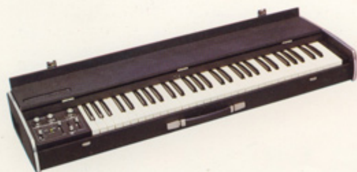
EKOPIANO 200 (N. 3218)

Un piano polyphonique aux performances supérieures et au prix vraiment convenable par rapport à la qualité. Un clavier 61 touches (FA-FA). Effets: Piano et Harpsichord.