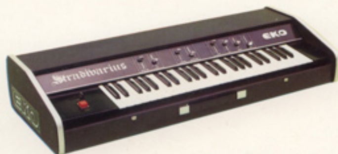
STRADIVARIUS (N. 3217)

Tastiera 49 tasti per effetti speciali di Violino, Viola, Violoncello, Contrabbasso, Registri: Violino 4', Viola 8', Trumpet, Horn. Può essere usato con amplificazione separata oppure inserito in qualsiasi organo con amplificazione incorporata.