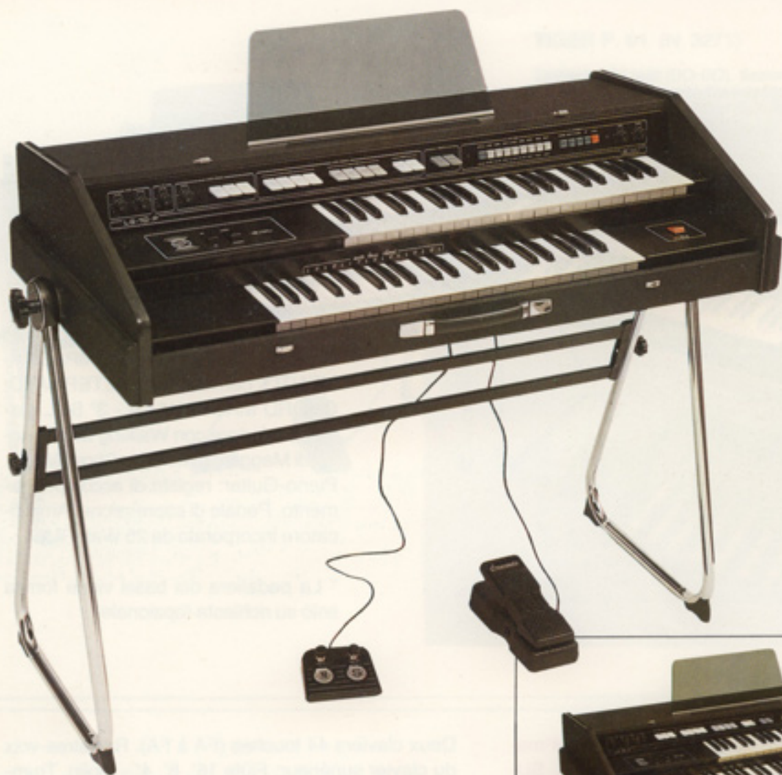
LS.10.P (N. 3247)

ORGANI ELETTRONICI PORTATILI PORTABLE ELECTRONIC ORGANS ORGUES ELECTRONIQUES PORTATIFS