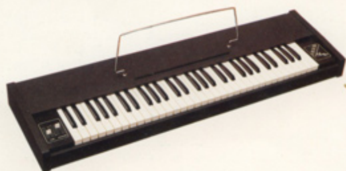
PIANO 300 (N.3219)

Clavier 49 touches pour effets spéciaux de: Violino, Viola, Violoncello, Contrabasso. Registrations: Violino 4', Viola 8', Trumpet, Horn. Cet instrument peut être utilisé par connection avec un amplificateur extérieur ou avec l'ampli d'un orgue.